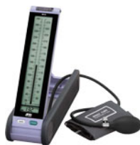
The Mercury Free UM-101

When people think of A&D, they think of us primarily as a weighing instruments manufacturer that provides a wide range of products, from analytical balances to huge track scales. However, in Japan, A&D is also known as a manufacturer of medical weighing products for professional use in hospitals and clinics. A&D products are commonly used in a number of dialysis clinic monitoring devices since such devices rely on very accurate measurements. At KIMES, we exhibited two barrier free scales and one bed scale. Based on the demographics of the crowd these scales attracted at KIMES, it was apparent that our scales caught the attention of medical specialist interested in weighing. The picture on the right above shows two of our barrier free scales, the AD6105 and the AD6106. These barrier free scales incorporate a universal design, have a low profile, and provide numerous benefits to patients: the platforms are intentionally very low, making it easy for patients to mount the scale with their wheelchairs in order to perform weight measurements by themselves. The scale featured in the picture on the left is the AD4922, one of our bed scales. The product is demonstrated using a miniature bed. Weighing is performed by simply placing one of the four round loadcells under each foot of the bed.