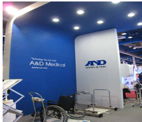
Barrier free scales, the AD6105 & AD6106

When people think of A&D, they think of us primarily as a weighing instruments manufacturer that provides a wide range of products, from analytical balances to huge track scales. However, in Japan, A&D is also known as a manufacturer of medical weighing products for professional use in hospitals and clinics. A&D products are commonly used in a number of dialysis clinic monitoring devices since such devices rely on very accurate measurements. At KIMES, we exhibited two barrier free scales and one bed scale. Based on the demographics of the crowd these scales attracted at KIMES, it was apparent that our scales caught the attention of medical specialist interested in weighing. The picture on the right above shows two of our barrier free scales, the AD6105 and the AD6106. These barrier free scales incorporate a universal design, have a low profile, and provide numerous benefits to patients: the platforms are intentionally very low, making it easy for patients to mount the scale with their wheelchairs in order to perform weight measurements by themselves. The scale featured in the picture on the left is the AD4922, one of our bed scales. The product is demonstrated using a miniature bed. Weighing is performed by simply placing one of the four round loadcells under each foot of the bed.