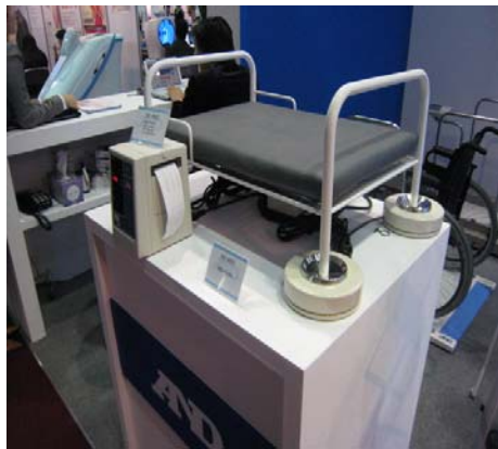
Easy-to-use bed scale, the A&D 4922

The photos above show two of our booths at KIMES. The prevailing colors are A&D blue and white. These booths simply looked great and reflected our corporate brand image.