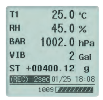
All items (numeric)

Results are graphed using automatic scaling so you can grasp chronological changes quickly and intuitively.