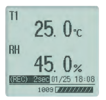
Two items (numeric)