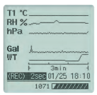
All items (trend graph)