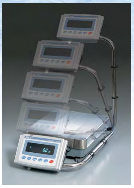
Swing Arm Display