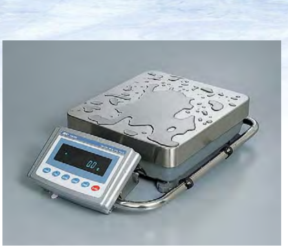
Compliant with IP65 (resistant to dust, water and moisture)