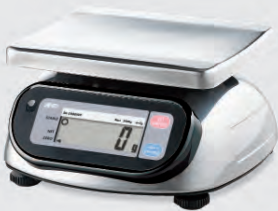
Model Capacity & Resolution